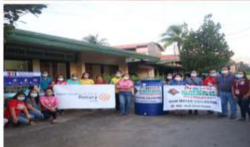
Turn-over of Handwashing Kiosk at Briz Elementary School 25 September 2020