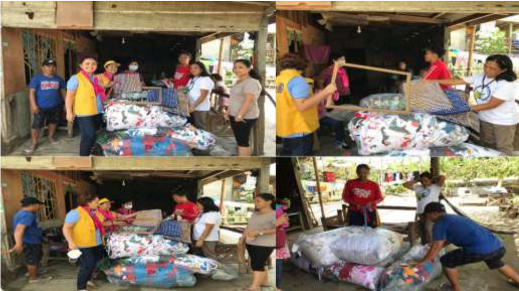
Delivery of textile strips to beneficiaries of Rag Making Livelihood Project 29 September 2020