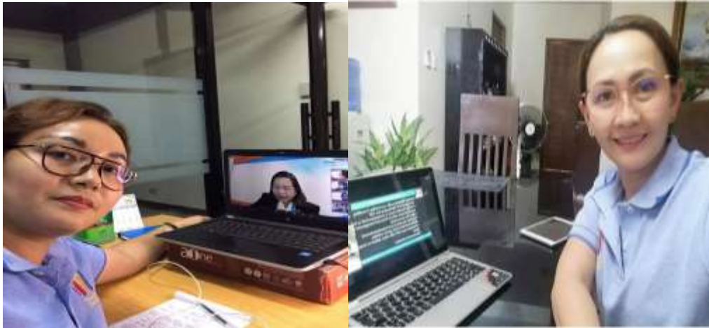
Membership Training Seminar 19 September 2020