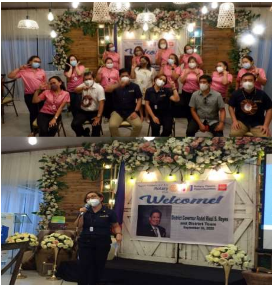
District Governor Riezl Reyes' visit 30 September 2020