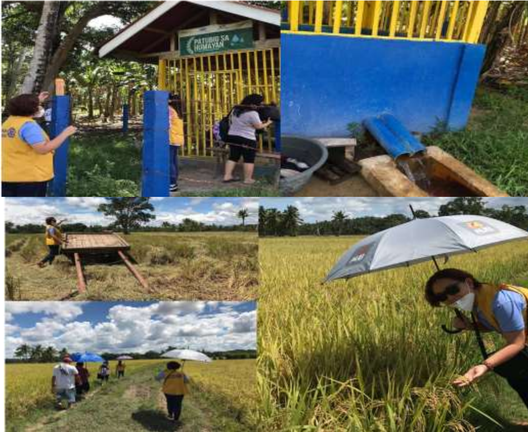
Regular visit and monitoring of Patubig sa Humayan Project 29 September 2020