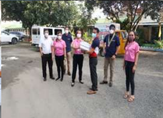
Turn-over of Knowledge on Wheels Van Edition project to DepEd Tagum City Division 25 September 2020