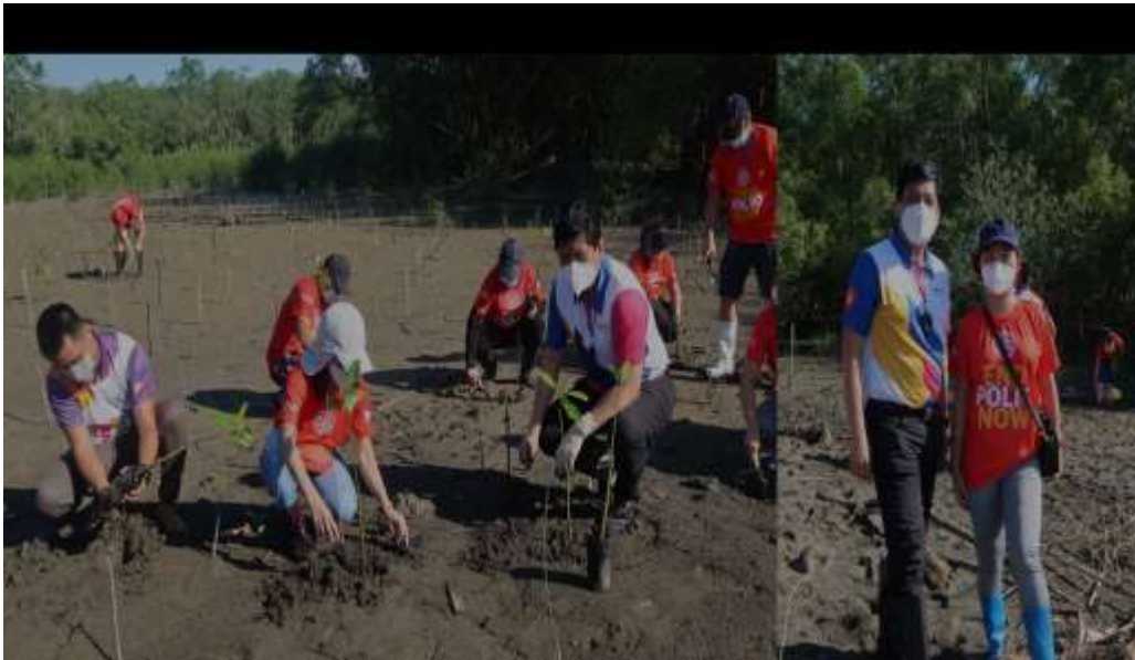
Mangrove Planting 25 September 2020